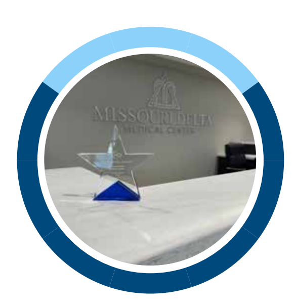
Health Equity Award

Missouri Delta Medical Center has been awarded the 2023 Health Equity Award by Health Quality Innovator (HQI) for the creation of the Missouri Delta Patient Food Pantry which opened in February last year. The Health Equity award category recognizes organizations that have successfully implemented interventions and approaches to address disparities across a range of conditions and improve healthcare quality and outcomes. Since the inception of the pantry, 351 patients were discharged from Missouri Delta with a large bag of food and a referral to the SEMO Food Bank, who in turn connects the patients to resources such as senior food boxes, SNAP benefits, info on local food pantries and more. The Foundation, with huge support from the VFW Post 3174 in Sikeston, keeps the Patient Food Pantry stocked and ready with needed items.